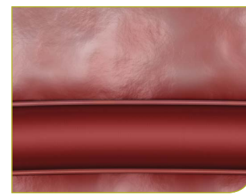
The sealant dissolves within 30 days leaving nothing behind but a healed artery or vein