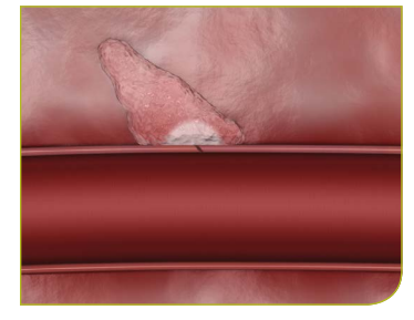
Platelets and blood cells collect inside the sealant's porous matrix