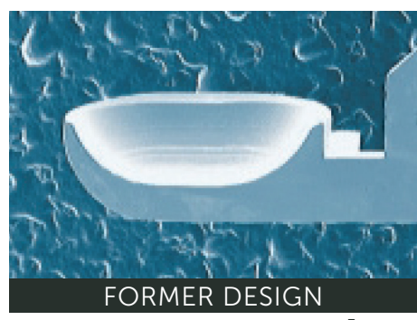
Jaw volume = 1.84 \text{mm}^3